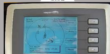
Optional chart plotter/radar and heading sensor