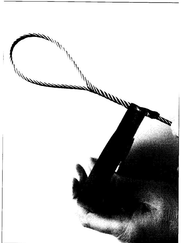
Serve over with tape.