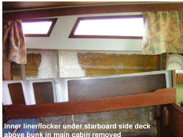
Inner liner/locker under starboard side deck above bunk in main cabin removed

I now covered the top of the bolts just under the bolt head with sikaflex to prevent water ingress in the holes and put the bolts through the cleats. After that the underside of the cleats were covered with a layer of sikaflex and everything was put in place. Now, before tightening the bolts the sikaflex had to harden to prevent it from squeezing out.