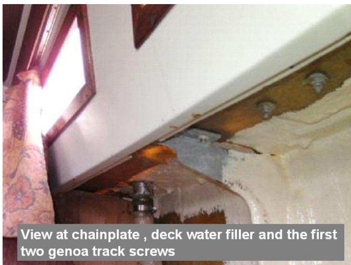
View at chainplate , deck water filler and the first two genoa track screws

After a day or two the nuts with underplayed body style rings were tightened and I could start reinstalling the liner/locker again.