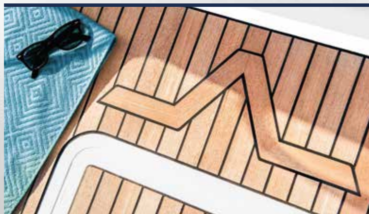
Teak beach platform