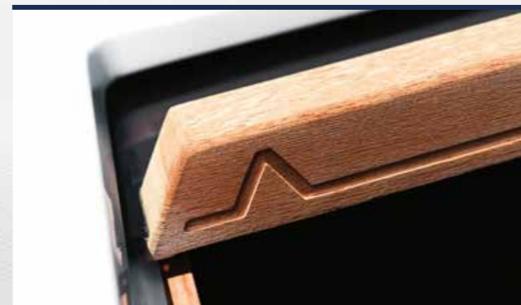
In-house finished woods