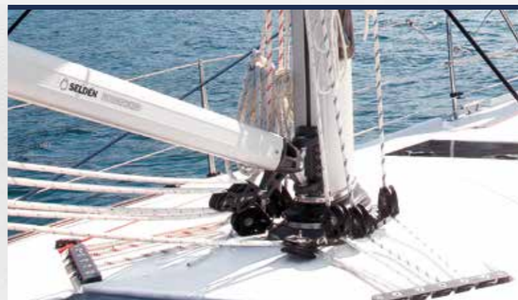
A rigid vang to boost performance