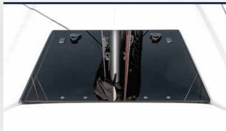
Large flush deck hatches to facilitate movement and lower deck lighting