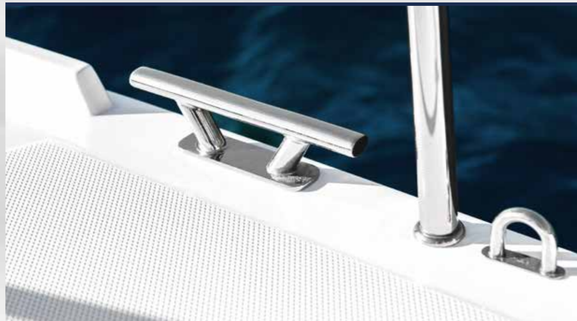
In-house stainless steel