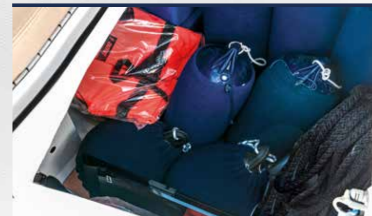
Double external stowage areas under benches