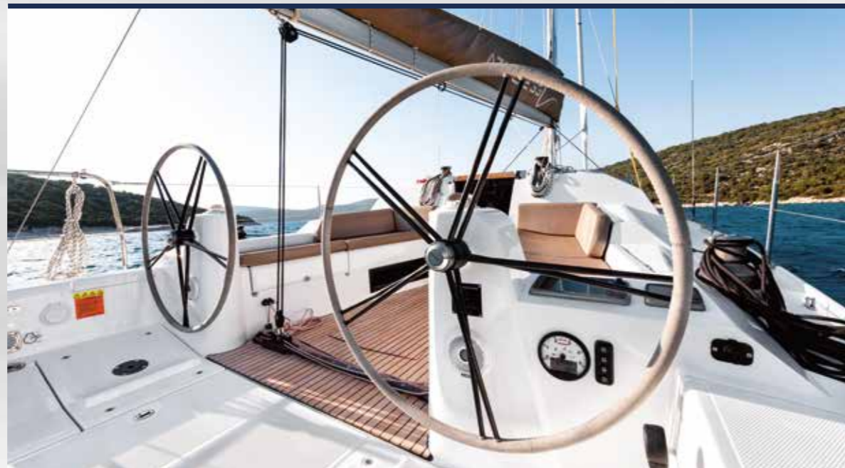
Twin wheels with controls and instrumentation