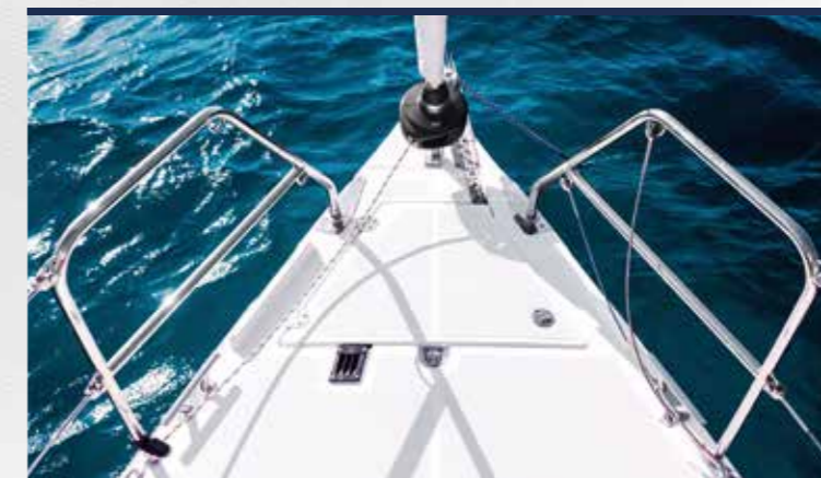
A large anchor area to facilitate manoeuvres in tricky conditions