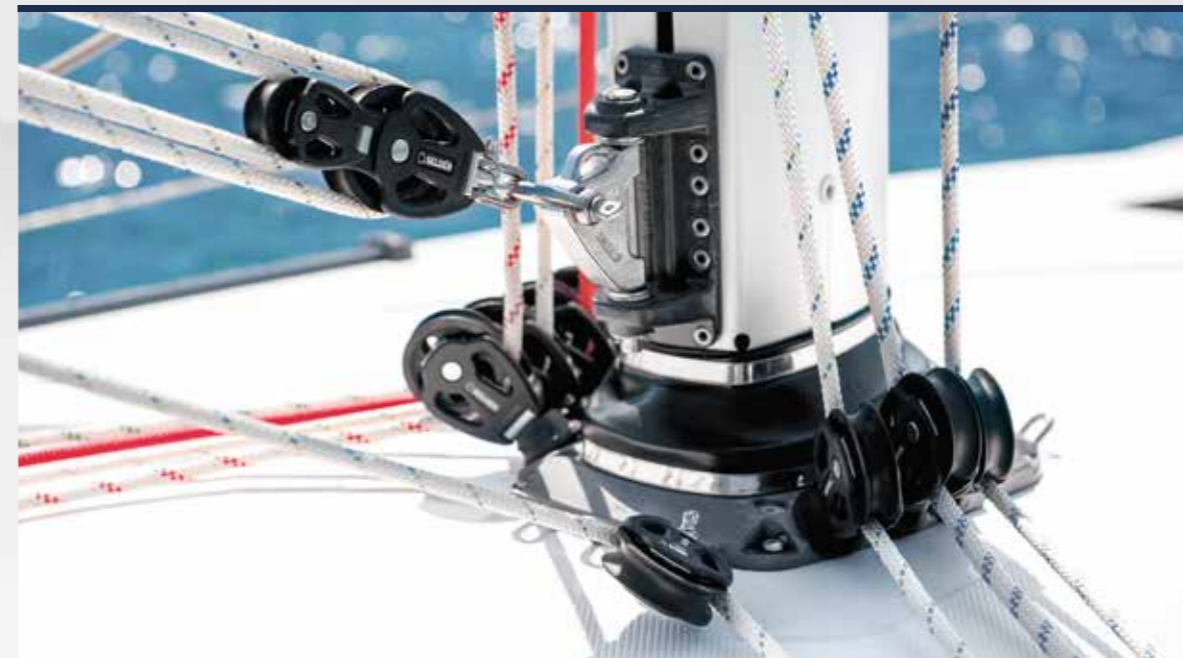
Seldem integrated mast