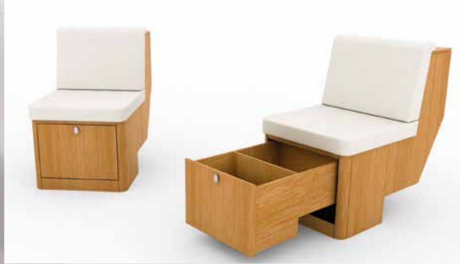
The more the merrier

Day sailor, cruiser, occasional racer, sailor with kids: if the owner intends spending long periods aboard, extra stowage space can be created in the master and guest cabins by adding extra closets - very handy for both family vacations and cruising.