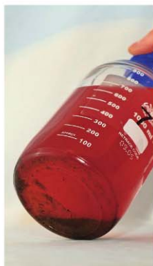
Excellent filterability and kill rate, and only minor debris

Grotamar 82 was developed to combat problems from low-sulphur biodiesel blends, and achieves its aim well. The 92% kill rate is good, and the sample proved the swiftest of the biocide-treated fuels through the filter. The product did a good job of dispersing the water into the fuel, although this is not its primary purpose. There were some minor deposits left in the bottom of the flask.