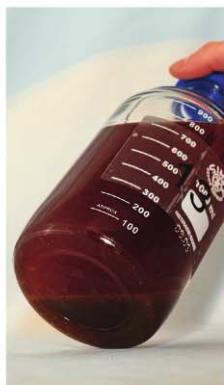
Gummy deposits suggest a bigger dose is needed

Diesel Plus is claimed to be more than just a biocide, improving fuel efficiency and making your engine run more smoothly. Unfortunately, on our test it yielded below-average performance with gummy deposits and poor water dispersion at a high price. However, the 24-hour result shows that it did set to work swiftly, suggesting that a higher initial dose may be needed in severe contamination cases.