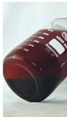
No gummy deposits, but water will need treating

This product made a great start by doing 86% of its total work in the first 24 hours. In the test flask there was no evidence of gummy deposits that block filters and for this reason our expert observed that the product would be beneficial in cleaning your engine. However, the remaining microbial life and water in the fuel suggest that further treatment would be advisable.