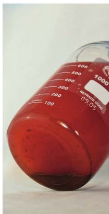
A good kill rate, filter result and water dispersal

Fuel Doctor gave good test results, and inspection showed excellent dispersal and no gummy deposits. Some large crystals were seen at the bottom of the sample, which Fuel Doctor explain are formed from dried dead biomass which will disperse with continued use of the product. A filter change after 10-20 hours running is recommended.