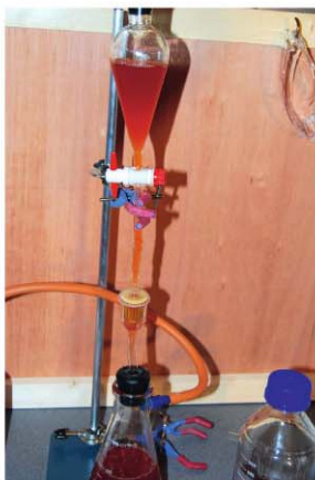
We filtered 500ml of treated fuel through a 10 micron filter

This makes the test a more accurate assessment of whether life still exists, as cATP can only exist in living cells while the free ATP will survive after the cells have been destroyed.