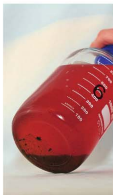
Good dispersal and speed, but further treatment needed

Our results suggest that this was the fastest biocide to act, doing all its work in the first 24 hours with no change over the next nine days (within the 5% error of the test). The bottom of the flask showed some gummy deposits and debris, but water was well dispersed. Marine 16 say that further doses will break down the debris. They offer another product for ongoing treatment, Diesel Fuel Complete (see page 100).