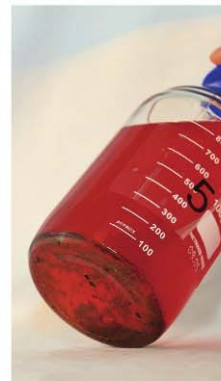
Sticky deposits are an issue, but a good kill rate

We used the lower dose for this test as Eradicate recommend the standard dose for all but the heaviest contamination. It proved highly effective, removing all but a few percent of microbial life and giving above average performance in the filter test. There were a lot of sticky deposits left in the bottom of the jar for which further treatment would be required to avoid filter blockage problems.