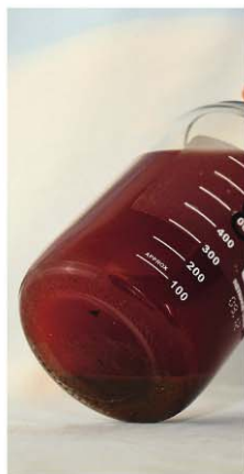
Excellent dispersal and no sticky deposits

This product gave a very good performance, with no gunge, only fine debris and all the water dispersed. A huge peak on our 24-hour test showed that it quickly broke down colonies and lifted them into suspension. Fuel Set claims to be made from natural compounds and also to clean your fuel system as it transits – the rapid action we observed will be of help here.