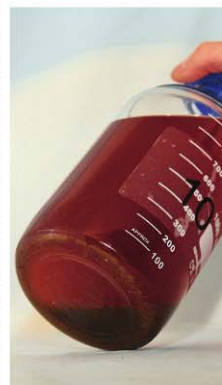
Cheap, but sticky deposits are of concern

Our results show Kathon with middle-of-the-road performance on both the kill rate and filter tests, but at just 0.6p per litre you could easily double the dose to increase its effectiveness. If you're a major fuel user this is worth considering. Of concern however were the sticky deposits left at the bottom of our sample, which would need attention, although it did disperse the water.