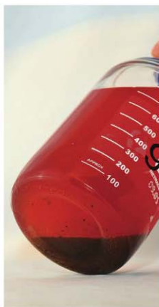
Fine debris passed quickly through our filter

The flask revealed minimal gummy deposits and a low debris level. The 24-hour data shows that Soltron set swiftly to work scattering microbe colonies, and the filter result was the best on test, showing that this is a good choice for breaking up contamination to be burned in the engine. Water dispersal was incomplete, but more time or a bigger dose are likely to solve this.