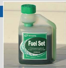
Choose a dispersant treatment for ongoing maintenance

There seems little doubt that with the introduction of biofuel mixtures, more boat owners are going to struggle with diesel bug. But it's something we're going to have to deal with and get used to, because it's here to stay.