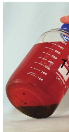
Some deposits and water will require treatment

Among the best on test with a 96% kill rate, Star Tron also excelled with a 47% improvement in filter speed. However, it did leave some sticky deposits in the jar and had not completely dispersed the water. Starbrite say that their product is most effective when the boat is used, as the engine will then process the treated fuel and destroy the bug.