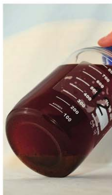
A good kill rate and no sticky deposits

Wasp recommend three dosage levels, so we chose the 0.2ml/lt rate suggested for a moderate case such as ours. Results were good, with the 98% kill rate among the best on test and an average 38% result on the filtration. The treatment cleaned the fuel effectively and left no sticky deposits, but did not do as well dispersing water, which would need separate attention to ensure its removal.