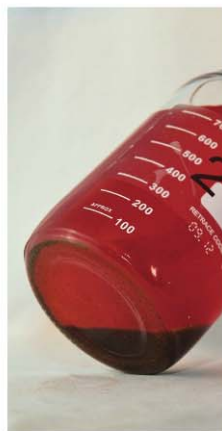
Deposits and poor dispersal suggest inadequate dosing

Claimed to not only kill diesel bug but also clean injectors, Fortron struggled in our kill rate test, although the filter result was good and the 24-hour figure suggests rapid action. Of most concern was the jar inspection, which revealed significant gummy deposits and poor water dispersal. A heavier shock dose might well improve these results significantly.