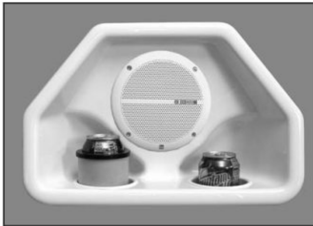
No. 54500300 17"W x 11"H x 5" Deep (432 x 279 x 127 mm)

OEM sales and minimum quantity restrictions may apply to some products