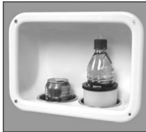
No. 54200300 (white cup holder) No. 54200800 (stainless cup holder) 12 3/4"W x 9 3/8"H x 4 1/2" D (324 x 238 x 114 mm) cut out - 11"W x 7 5/8"H (279 x 194 mm)