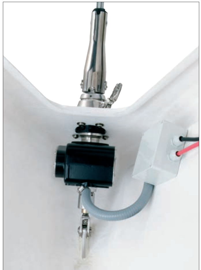
Installation of a Furlex 200TDE. The connection box is water-tight.

Furlex Electric is available for either on-deck or through-deck installations. The main advantage of a through-deck installation is better sailing performance as a result of maximised luff length. More space on the foredeck is an added bonus!