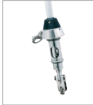
Ready to get powered up.