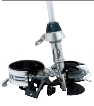
Remove line guard, line guide, rope and drum halves.