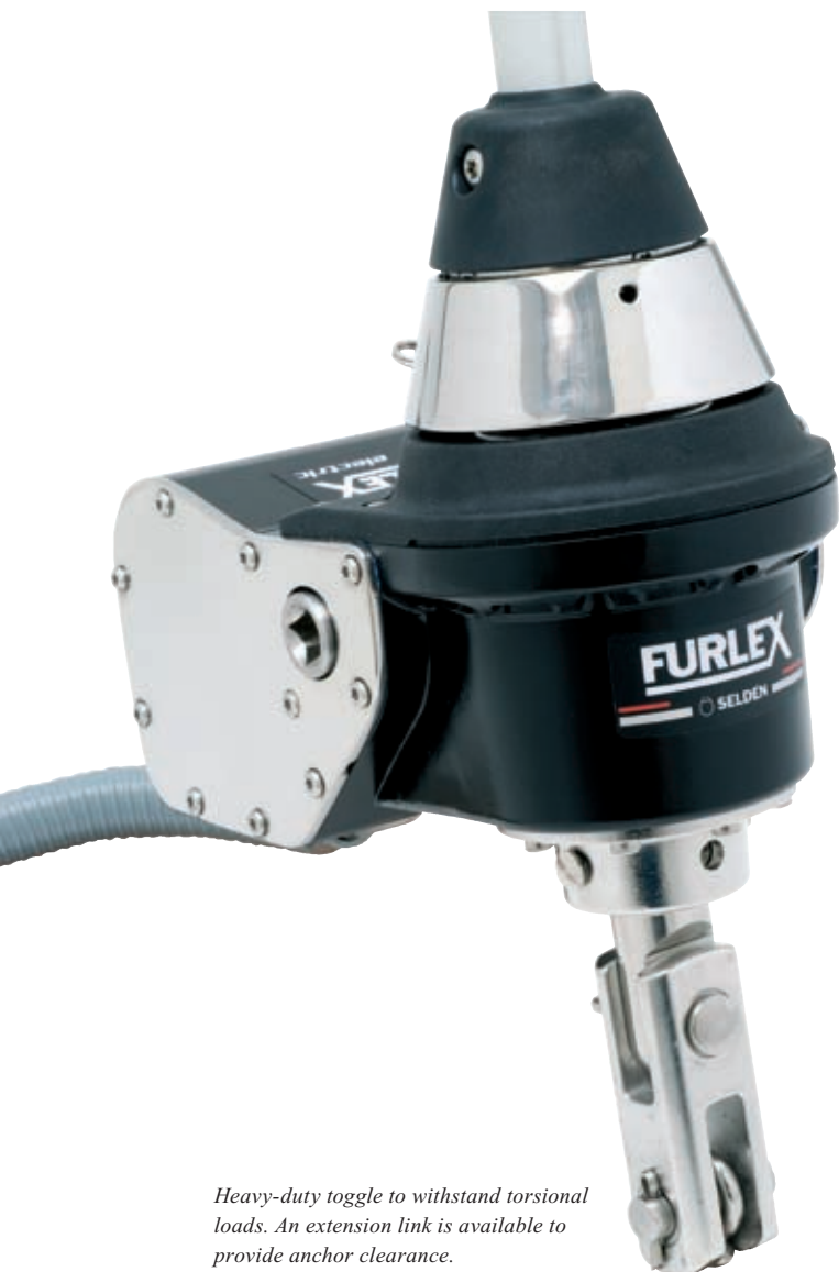
Heavy-duty toggle to withstand torsional loads. An extension link is available to provide anchor clearance.

In case of power failure, Furlex Electric can be operated manually.