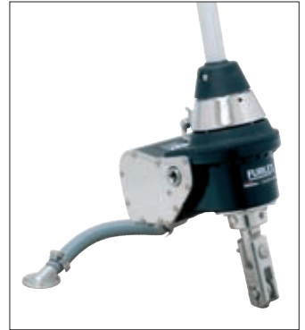
Slide on Furlex 200E from below and install the cables. Done!