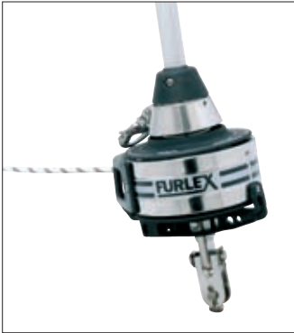
Manual Furlex 200S.

Push-button performance is an easy upgrade for anyone who already has a manual Furlex 200S, 300S or 400S series on their yacht. The furling line, drum and line guard assembly are simply replaced with a Furlex Electric motor unit. No sail conversion is required as the luff length of your existing sail is unaffected.